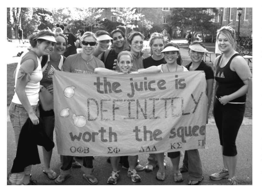
Tri Deltas cheer on their sisters in the Greek Week 3-on-3 basketball tournament.

ond in the three-legged race. Girls came decked out with a huge team banner, orange hats and head bands, orange face paint, and tons of energy to cheer on their team—see the picture below!