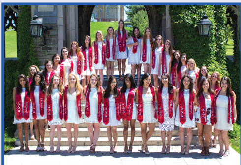
We miss our class of 2017 graduated seniors and wish them all the best!