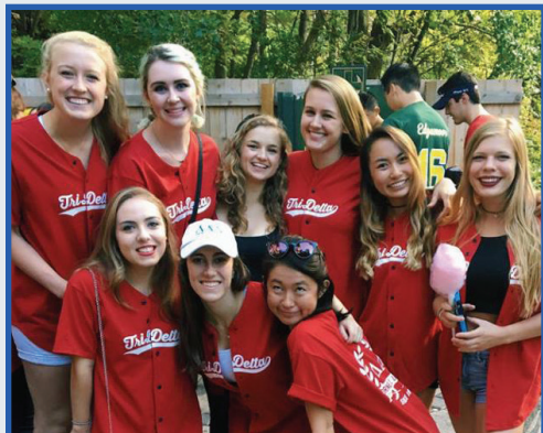
Members of Pledge Class '16 celebrate Homecoming together.