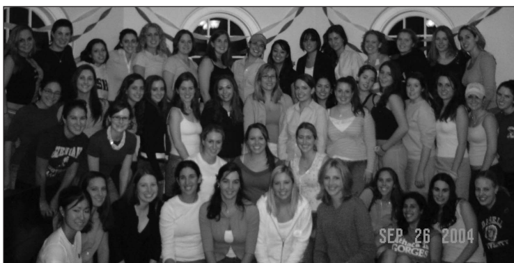
Our fall 2004 new members pose with the chapter on bid night.

We began the semester with a successful officer retreat at Buttermilk Falls. The day provided us with a chance to look back at what we had accomplished and look ahead to what we still wished to do. Out of the retreat came about 15 committees for all sisters to sit on, which will allow them to become more active in chapter activities. These committees also provided the officers with a group of sisters who could specifically help with projects that need more than one set of hands.