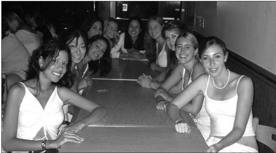
Sophomore Tri-Deltas celebrate October birthdays with a dinner out.