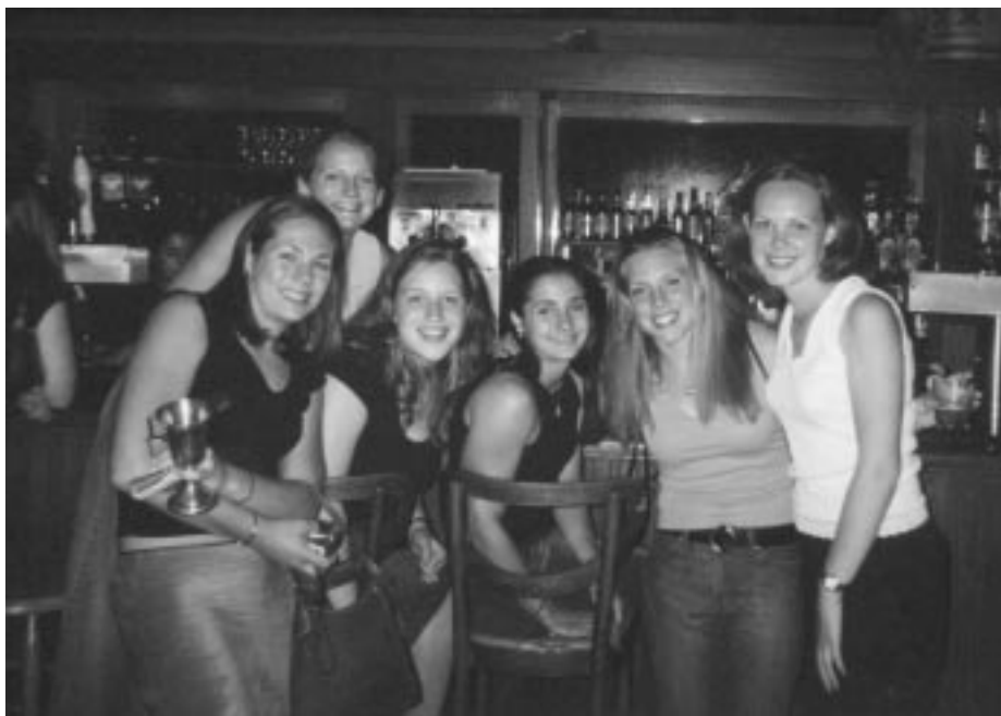
Some seniors enjoying a silver goblet event at the beginning of the semester.