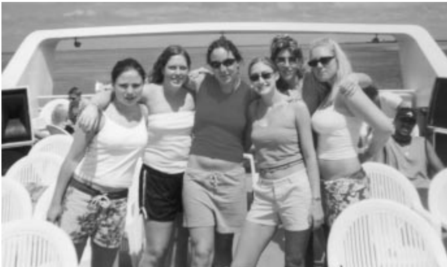
Left: Tri-Delts bask in the sun on spring break in the Bahamas.