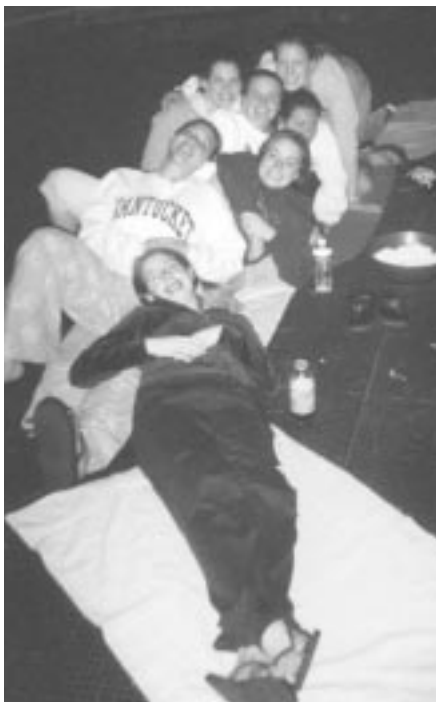
Some in-house sisters make the Delta deck (or third-floor roof) into an outside movie theater and sleepover.