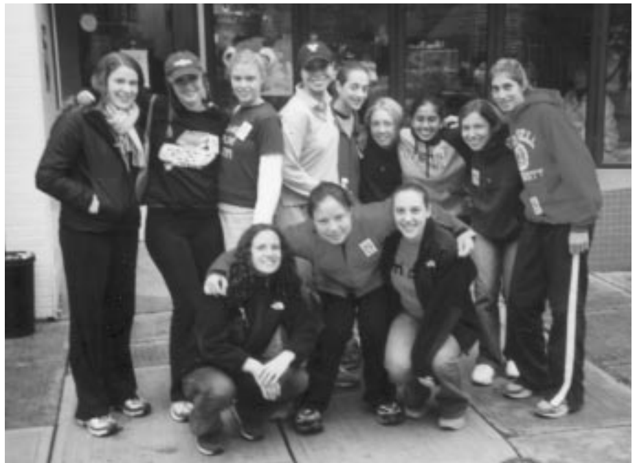
Tri-Delts participated in the Ithaca Breast Cancer Alliance Walk on October 26, 2002. They walked through downtown Ithaca to help raise awareness and money for the fight against the disease.

I realized this summer when I went to our national convention in Orlando, Florida, that Tri-Delta officers are the same all over the country. I attended the five-day conference with presidents and officers from all 137 Tri-Delta chapters across the United States and Canada. We all came from different states with different size schools with different size chapters. Our chapters do different activities, and each chapter has its own unique per-