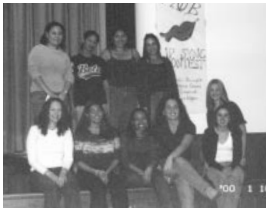
Sisters of Tri-Delta and Omega Phi Beta gather before the lip-sync philanthropy event.