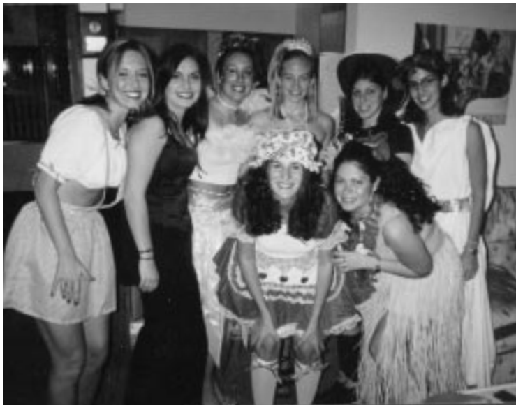
Seniors in costume on their way to Tri-Delta's 2001 Halloween crush party.