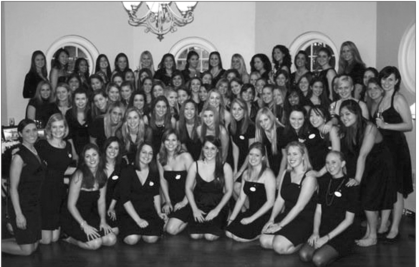
All of the sisters on the last day of formal recruitment!