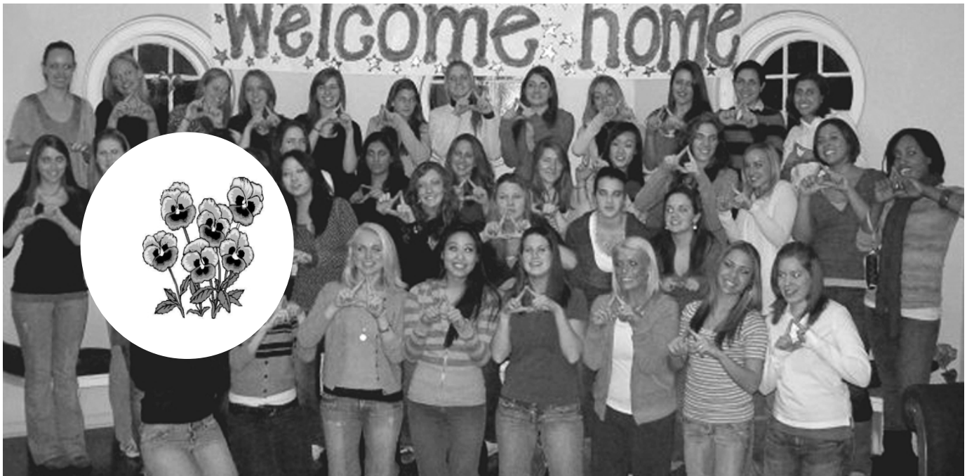
Pledge Class 2008 on Bid Night!