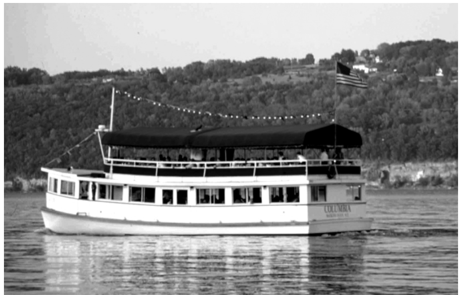
One of Captain Bill's cruise ships on Seneca Lake.