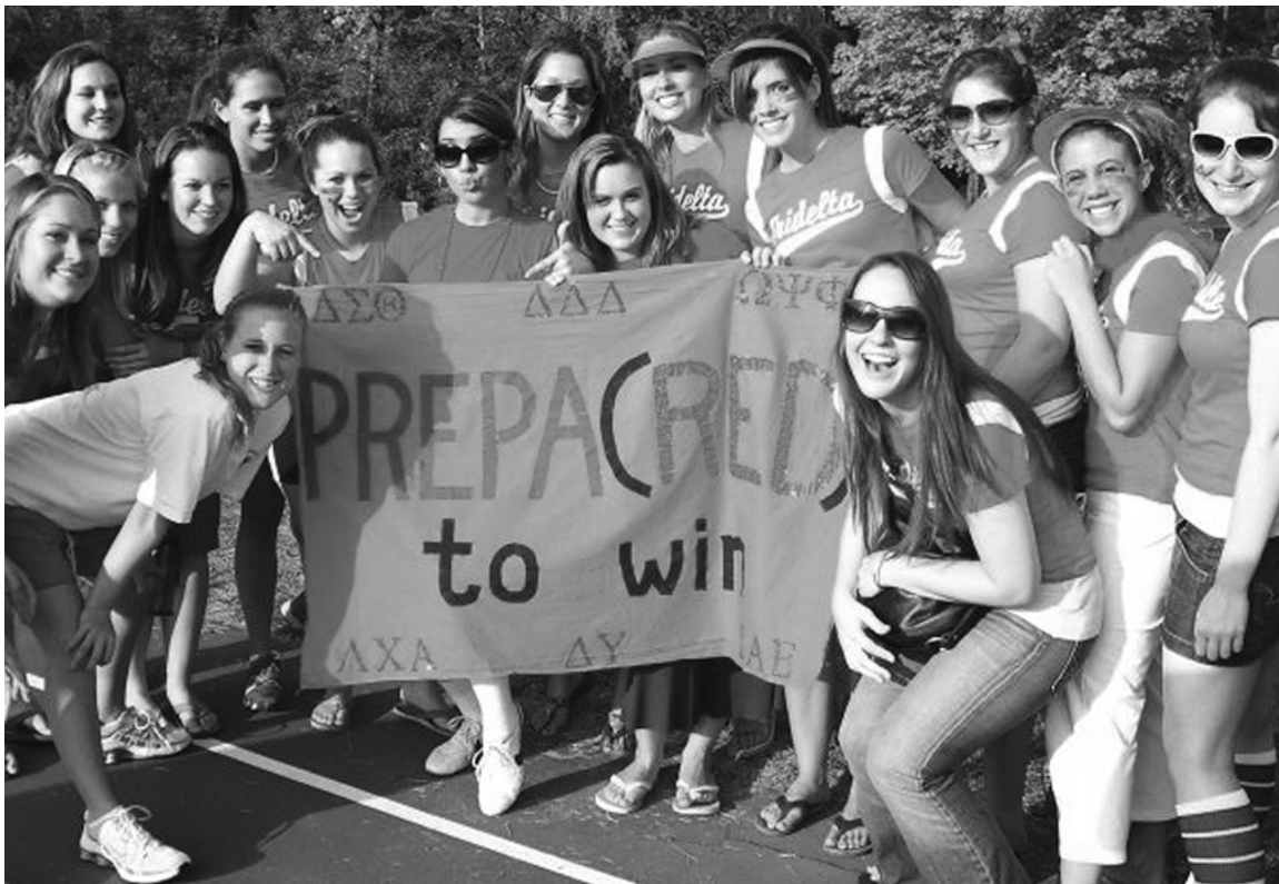
Congratulations to Tri Delta's Team Red for their Greek Week victory! After four arduous days of banner-making, basketball-playing, team-cheering, and competitive pie-eating, the ladies of Delta Delta Delta took home the gold.