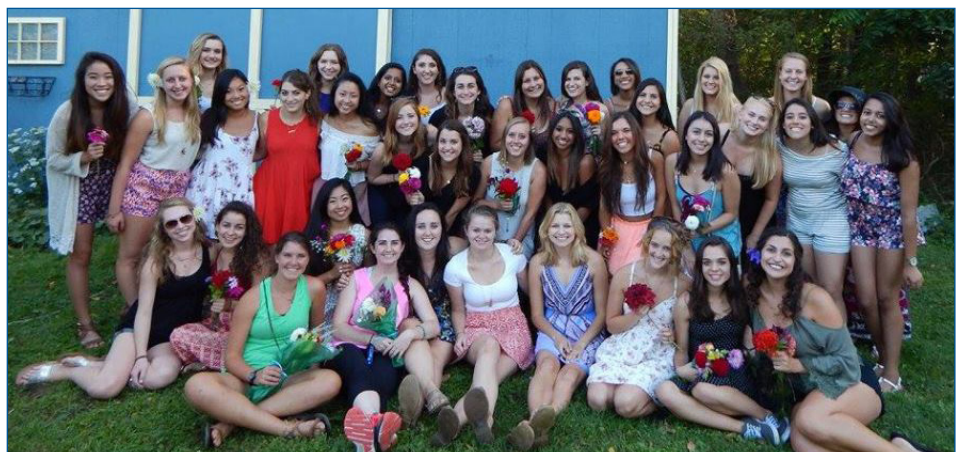
Tri Delta members of all classes bond at a flower picking sisterhood event.